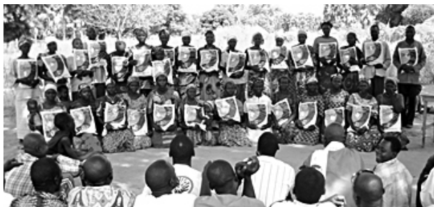
Women Receive Their Nets