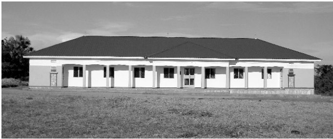
First building on 15 acres of campus

When we first visited with the Ugandan Christians at a workshop in Kampala, Uganda in 1992, we did not visualize the opening of the school at Kigumba in October 2011. We did agree to teach the men and women sent by the Ugandan church to Jos for Bible training. They sent the men and women and, by God's grace, we now have a school staffed by Ugandans. To God be the glory!